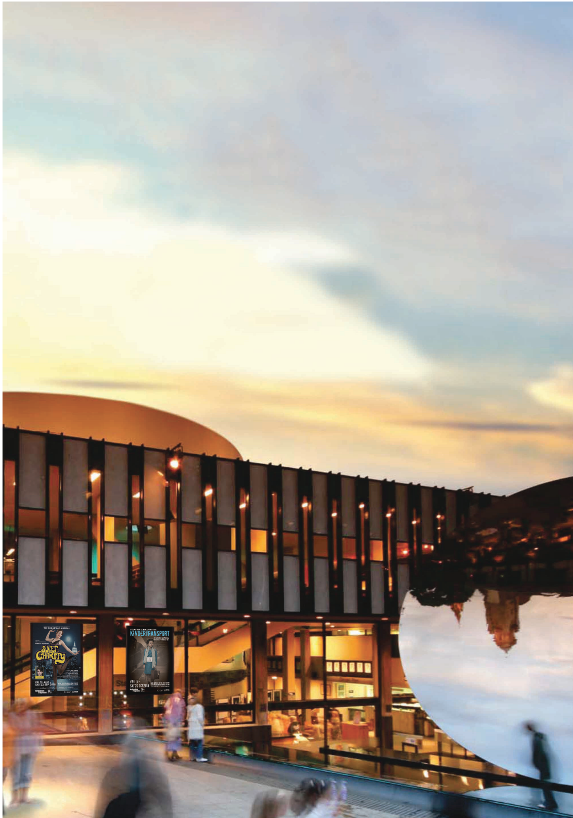
Nottingham Playhouse frontage.