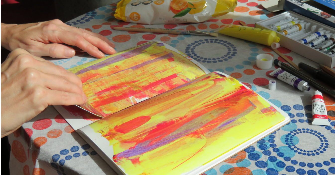
Reflective Journaling in action on the Boosting Resilience Programme.