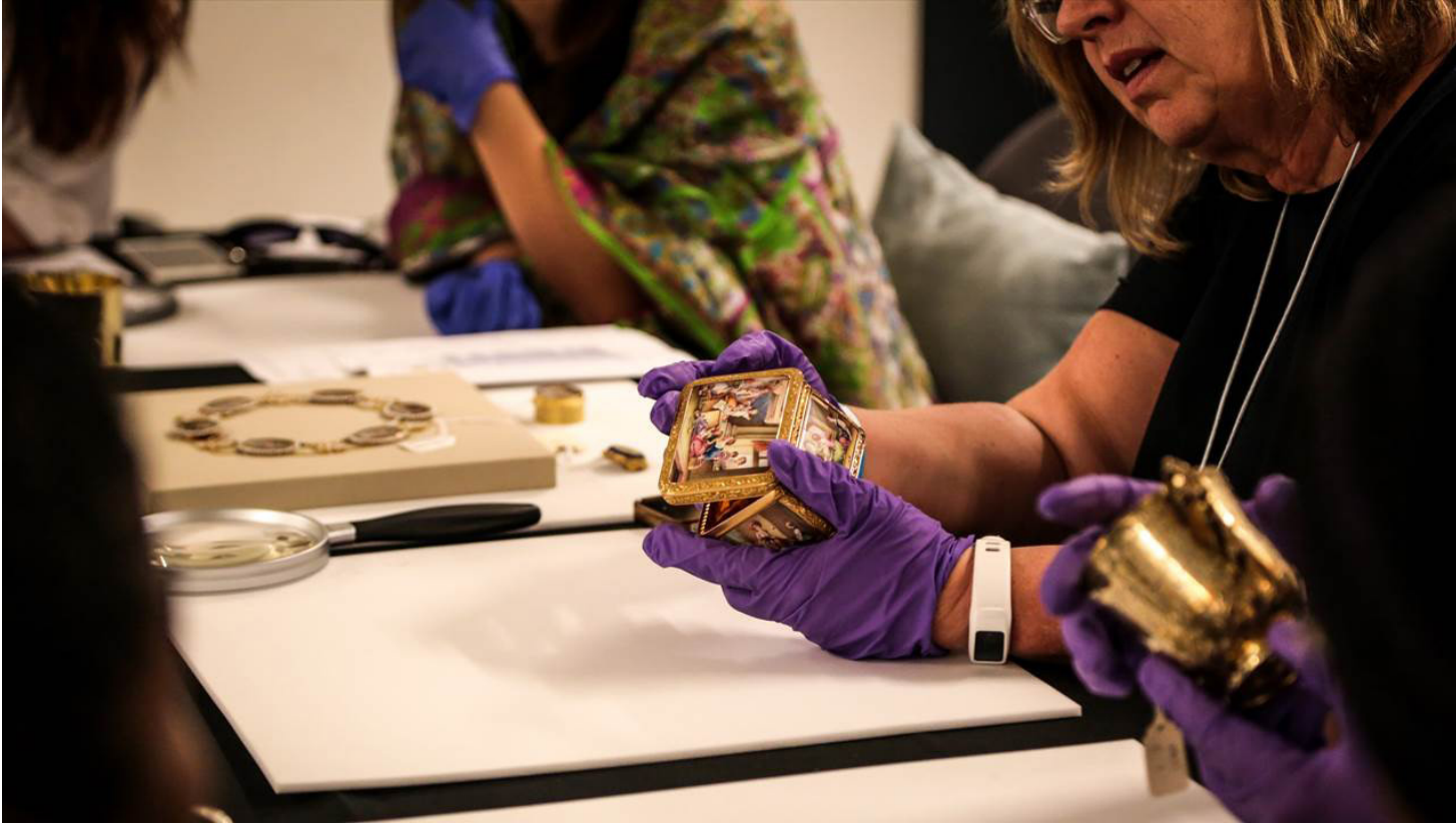
V&A Collections and Curators class - handling session with the Gilbert Collection. Demonstrating how the unique content and IP assets of the museum is harnessed through Academy programme